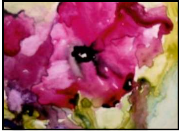
Watercolor on Yupo by Lana Bittner