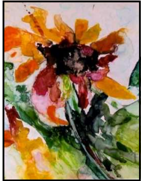
Watercolor on Yupo by Lana Bittner